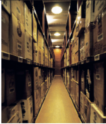
Above: Crown Wine Cellars in Hong Kong. The region is now the fine wine hub of Asia

Both Sotheby’s and Christie’s claim that they give buyers the opportunity to return a wine in certain circumstances, yet the terms are generally narrowly drawn, with disclaimers designed to let them off the hook if they do get it wrong. As a buyer, I wouldn’t take great comfort from Sotheby’s disclaimer: ‘All property is sold “AS IS” without any representations or warranties, express or implied, by Aulden Cellars, Sotheby’s or the Consignor as to merchantability, fitness for a particular purpose, the correctness of the catalogue or other description of the physical condition, size, quality, rarity, importance,